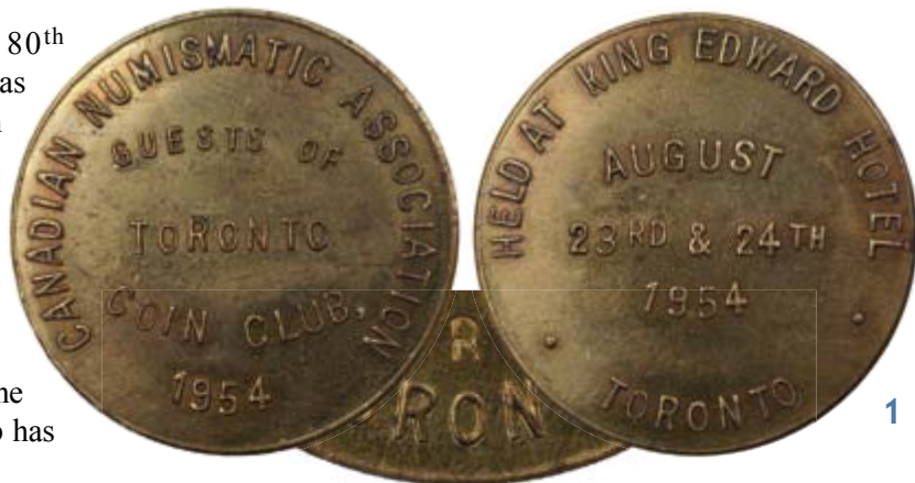
The 1954 CNA Convention medal (1), with a mintage of 200, was issued in brass; a single piece was struck in silver for presentation to Peter Favro. In the 60s the medal was re-issued in brass with a punched R, and in silver.

The most recent Toronto Convention, in 2004, hosted in conjunction with three other clubs, saw medals displaying the winged goddess of victory, copied from the statue atop the Prince's Gates at The Canadian National Exhibition grounds. The Toronto Coin Club was responsible for the design of the medal.